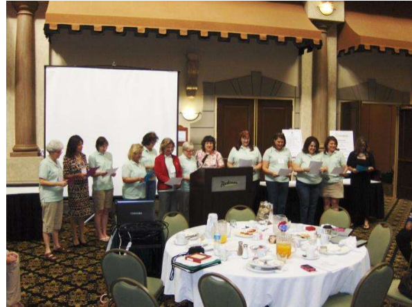
FWIT Board announcing the Call to Conference to be held in San Antonio in 2013

Call to Conference announced that the 2013 Annual Conference would be held in San Antonio in the fall and sponsored by the Association with the assistance of the San Antonio Virtual Members.