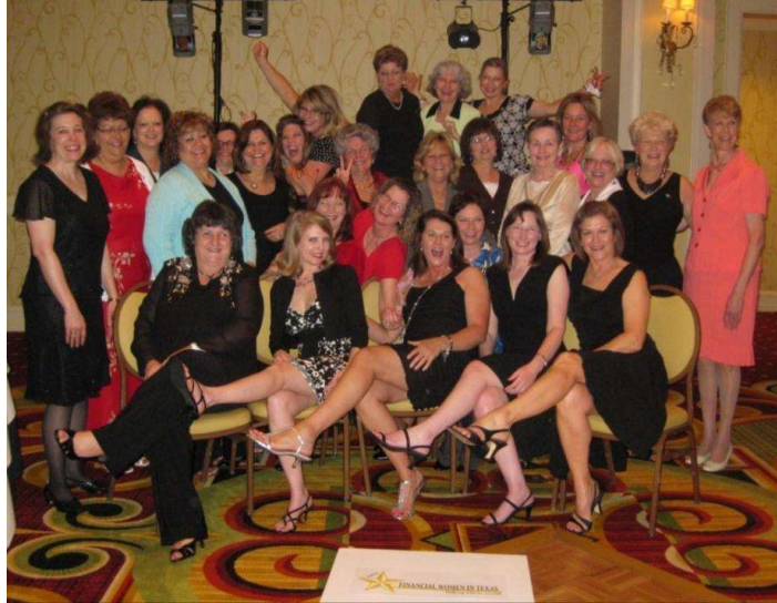
Attendees at the First Annual Conference of FWIT – April 2010, Austin Texas