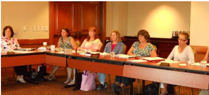
FWIT Board Planning Meeting August 4, 2012

The Association's Board of Directors met in Austin on August 4, 2012. The meeting was a joint meeting of the 2011 – 2012 Board of Directors and the elected and appointed members of the 2012 – 2013 Board of Directors. An official meeting of the 2011 – 2012 Board was held, followed by the transition meeting during which plans for the coming year were discussed by both Boards. Planning included drafting a budget for the Association's coming year, reviewing current and planned membership, discussing awards and scholarship proposals, and considering locations and hosting for the 2013 Annual Conference.