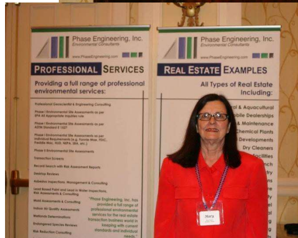
Left and below: Opening Reception Above right: One of the Conference exhibitors