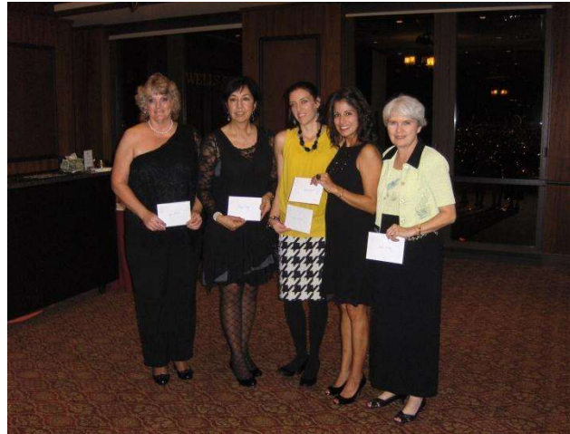
Scholarship Award winners