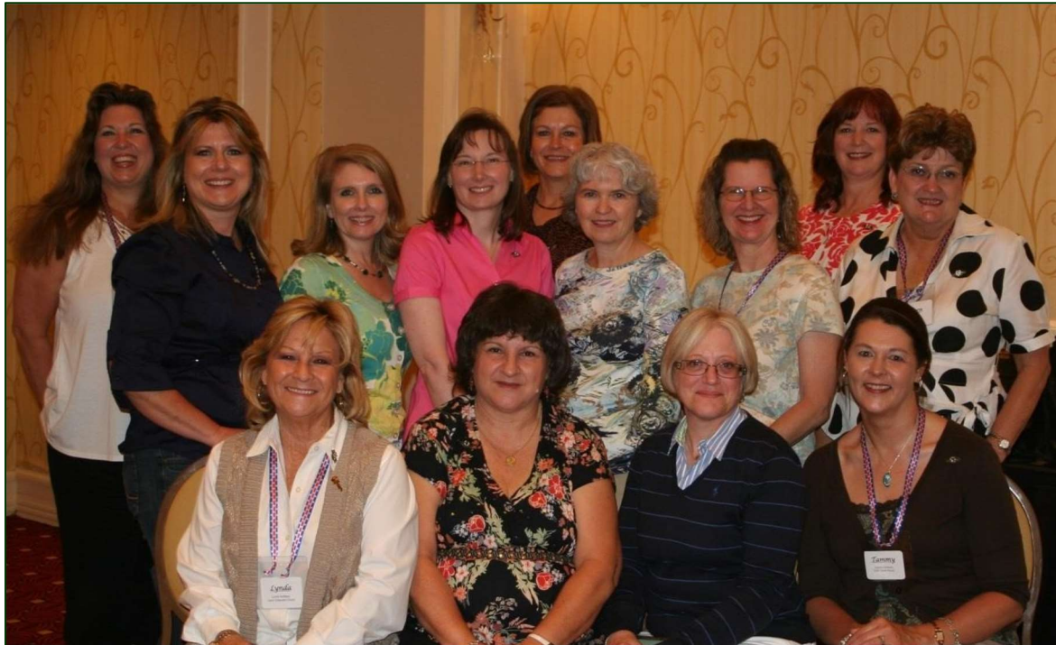
2009 – 2010 FWIT Board of Directors

When the group was formed there were 93 members of Financial Women International in the Texas District. At the end of its first year, there were 83 members on the official membership roll of Financial Women in Texas.