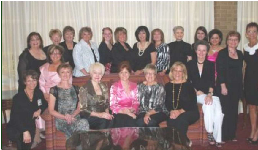
FWIT Annual Conference April 15 – 17, 2011