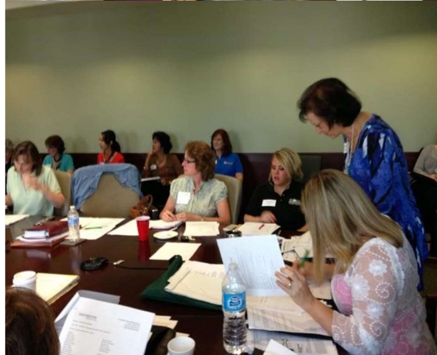
Women on a mission at the planning meeting