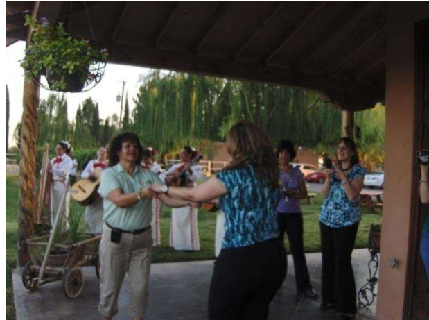
Saturday evening fun at Zin Valle Winery