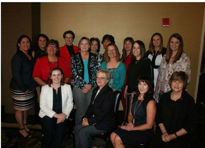
Financial Women in Texas 2017-2018 Board of Directors

The second amendment to the Association bylaws was approved by the Board of Directors on July 20, 2018. The purpose statement in the bylaws was amended to replace “financial services” with “finance”. The rationale was to be more inclusive of women who want to become members but are not directly in the financial services industry. Work continued on the strategic initiatives throughout the year.