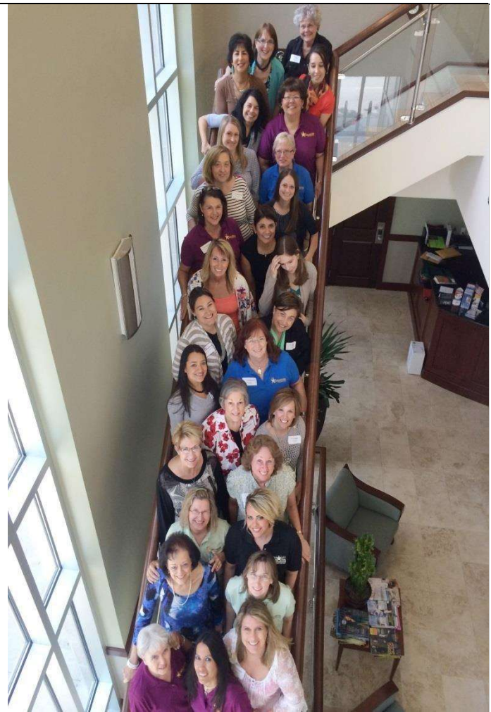
Great turnout of past, present and future leaders